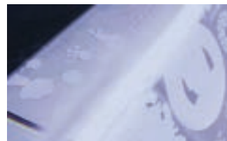
High-quality hot-melt powder, can be used repeatedly