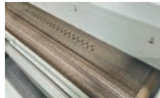
With belt system, you can cut off files, while printing. Since the film is fed by air suction system and cut production at the same time