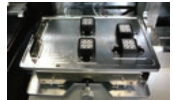
Automatic moisturizing cleaning components to ensure cleaning and working stability