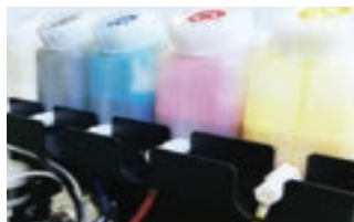
Stable bulk system ensures amazing printing speed