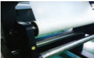
High-performance paper collection device. Adapt to a variety of materials