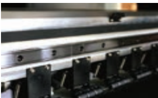
THK high-precision mute rail automatic