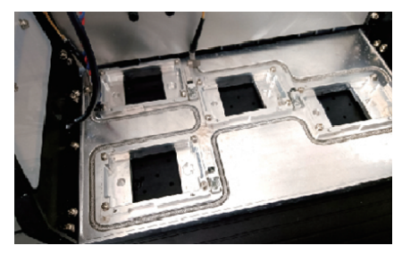
Heating of the bottom plate of the heads