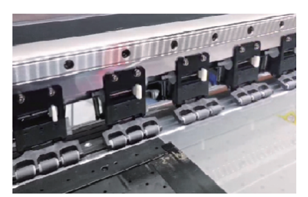
New pinch roller structure of three in group brings more stable feeding precision