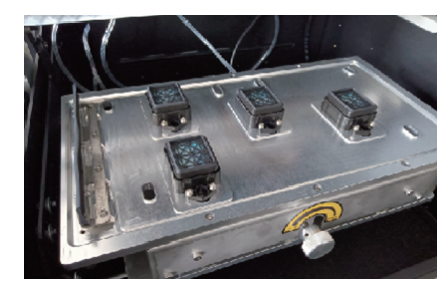
Automatic moisturizing cleaning assembly ensures the stability of head cleaning and improves working stability