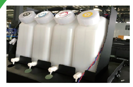
Stable 3L bulk system ensures amazing printing speed