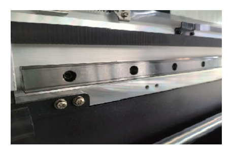
THK high-precision mute rail