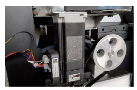
High quality DC servo motor with good stability and long life